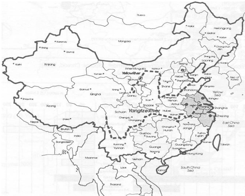
Figure 1: Map of the Yangtze Region

The main driver for economic growth in this region is the concentration of foreign investors which had become a major engine for economic growth for China. 21 In fact, China has been divided into twelve markets which are often distinct territories with each region having its own market characteristics. Because of these regional distinctions, foreign investors invested in the areas of interest which match their market characteristics. This led to the economic development of cities and provinces in China. 22